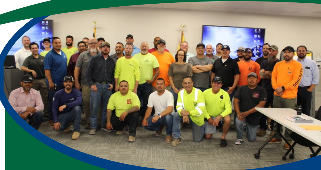
Supervisory Training Program Class of 2021