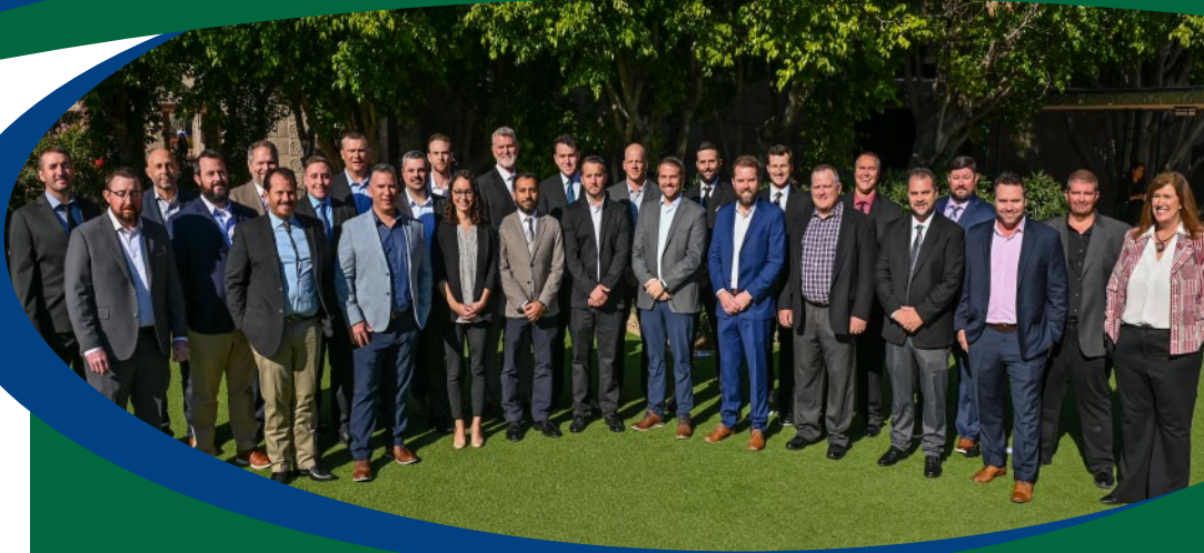
LDF Class of 2022