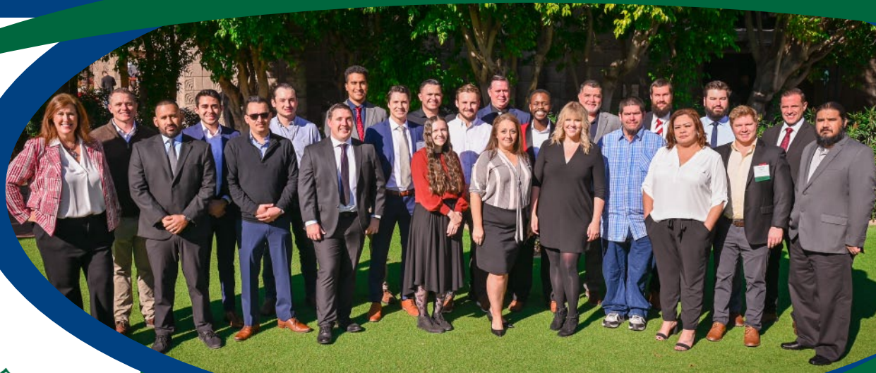
Emerging Leaders Forum Class of 2022