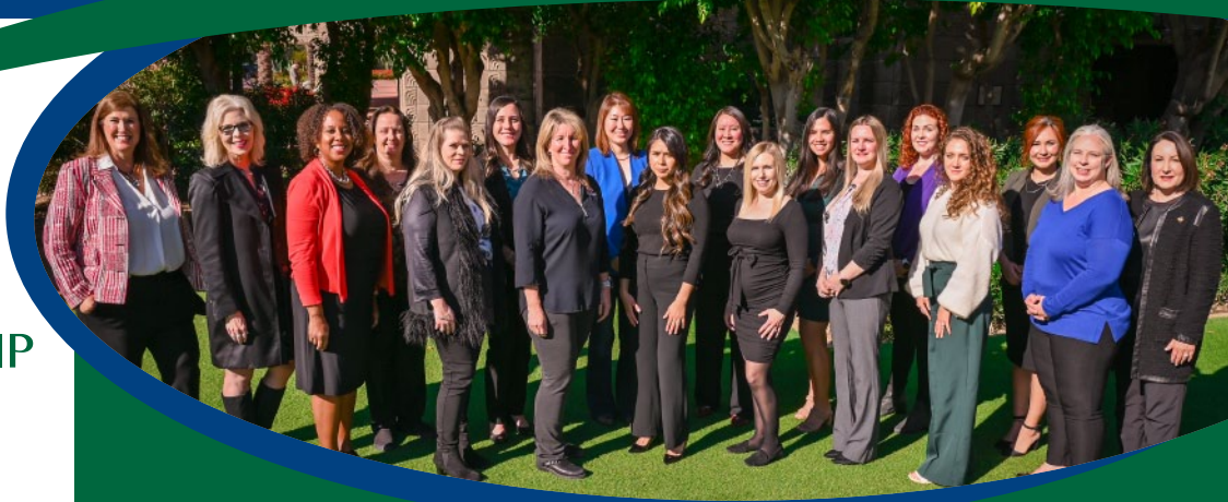
Women in Leadership Program Class of 2022