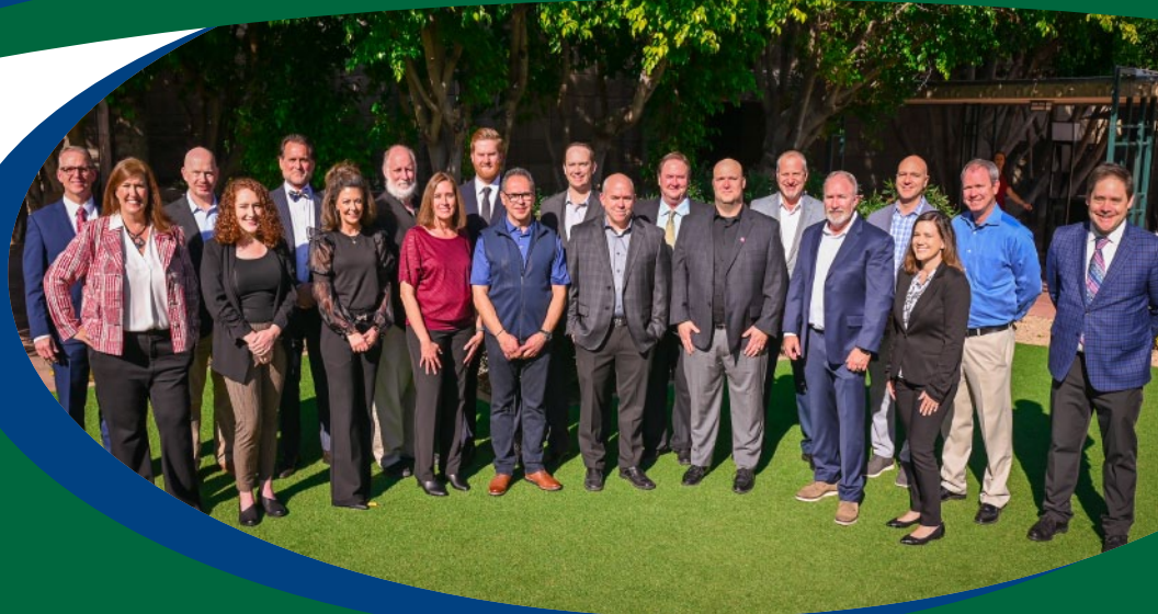
SEP Class of 2022