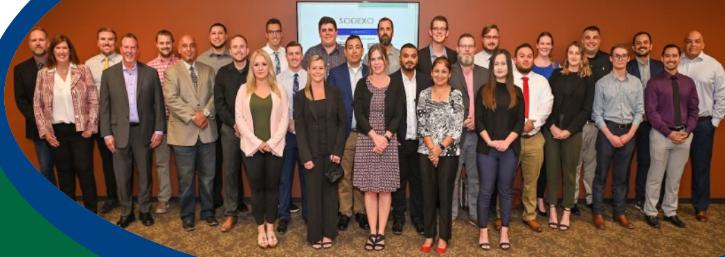
Project Manager Development Program Class of 2022